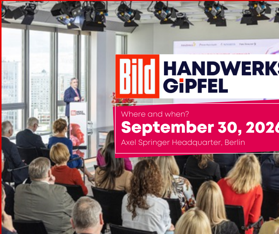
Bild HANDWERKS GIPFEL

Where and when? September 30, 2026 Axel Springer Headquarter, Berlin