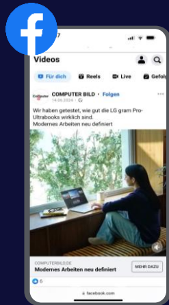
Facebook Sponsored Posts