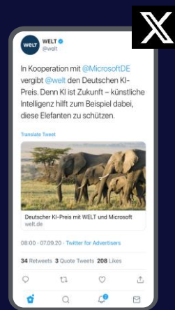
X (Twitter) Promoted Tweets