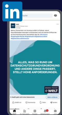
LinkedIn Sponsored Posts