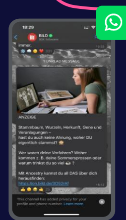
WhatsApp Posts or Instagram Content Posts (organic)