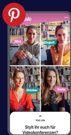
Pinterest Sponsored Posts