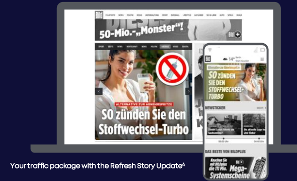
Your traffic package with the Refresh Story Update 4

Price according to booked views / booked product story package 2 + 1.500,00 € creation costs 3