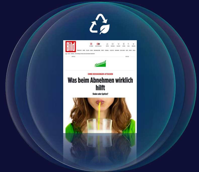
BILD Brand Story

The Refresh Story is an environmentally friendly and effective marketing strategy with reusable content ideas . Your message stays relevant, your ecological footprint stays small!