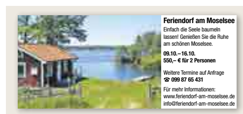
Formatbeispiel: 2-spaltig (92 mm)/40 mm hoch