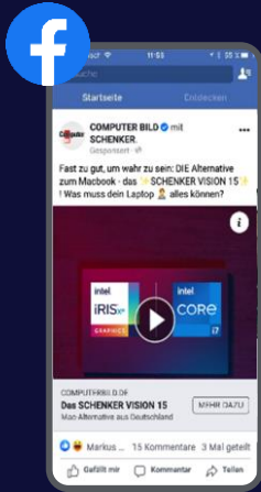
Facebook Sponsored Posts