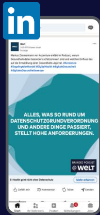
LinkedIn Sponsored Posts