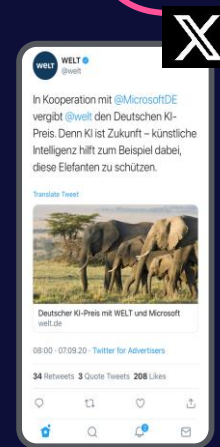
Twitter Promoted Tweets