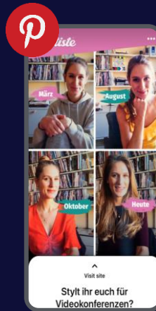
Pinterest Sponsored Posts