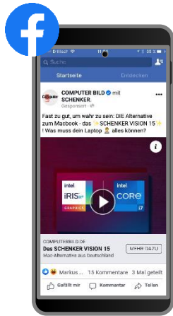
Facebook Sponsored Posts