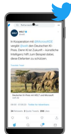
Twitter Promoted Tweets