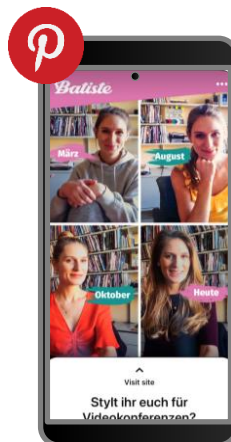
Pinterest Sponsored Posts